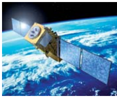
HD broadcasting is increasingly available, with most stations offering 1080i content

An LCD TV is the perfect centerpiece for the high definition digital lifestyle, serving as a multimedia display hub. Full HD resolution is fast becoming a necessity rather than a premium feature, and no other flat panel solution can offer the full HD, 2 megapixel, viewing experience in such a wide range of sizes as a TFT-LCD. LG.Philips LCD is at the forefront of the full HD revolution, offering a full line-up of industry standard LCD TV sizes in HD (1366x768) resolution: 23-, 26-, 32-, 37- and 42-inches. In addition, LG.Philips LCD offers premium full HD (1920x1080) panels at standard sizes of 42- and 47-inches. With the first quarter 2006 launch of the world’s largest Gen. 7 fab in Paju, South Korea, LG.Philips LCD delivers full HD panels at 42- and 47-inches in the large volumes necessary to allow for affordable consumer set prices. A full HD LCD display (1920x1080, 2 megapixels) makes a perfect multimedia hub for full HD content.