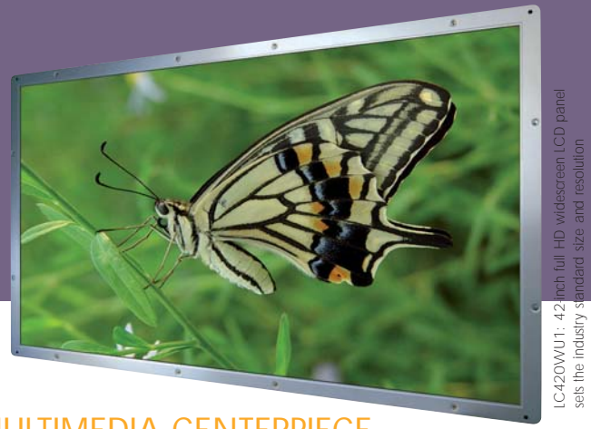
LC420WU1: 42-inch full HD widescreen LCD panel sets the industry standard size and resolution