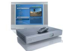
Media center PCs for web surfing, video and photos, and gaming