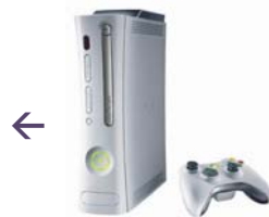
Next generation gaming platforms will offer widescreen full HD graphics